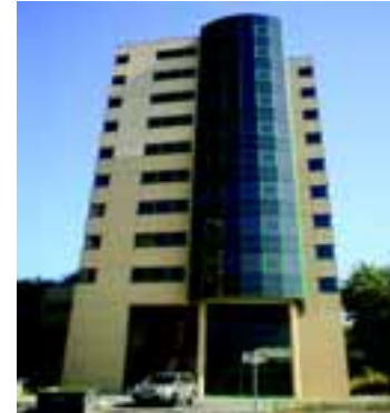
Jesionowa Tower – 6,500 sqm office building owned by KB Inwestycje.

The rents in class B buildings range from 9 to 12 EUR per sqm. Total class C office stock amounts to 21,000 sqm, and includes Wita Stwosza 2, COIG, and TOP. The high vacancy rate of 30% will pull rents down from today's 7 EUR per sqm.