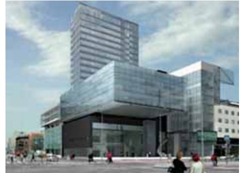
Two new office buildings in CBD on Tartu road developed by local developers Estconde and Norber Grupp

Rents for CBD class A buildings vary from EUR 11 to 16 per sqm. Ober-Haus expects class A office rents to remain the same over the medium term. Due to the balance of supply and demand, we do not anticipate class B office rents to soften below the